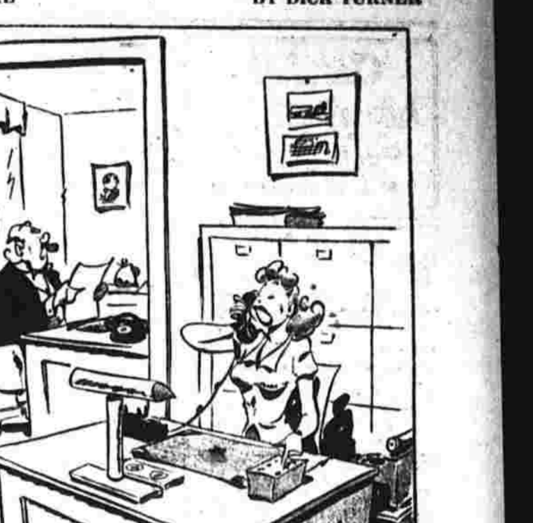
SENSE AND NONSENSE