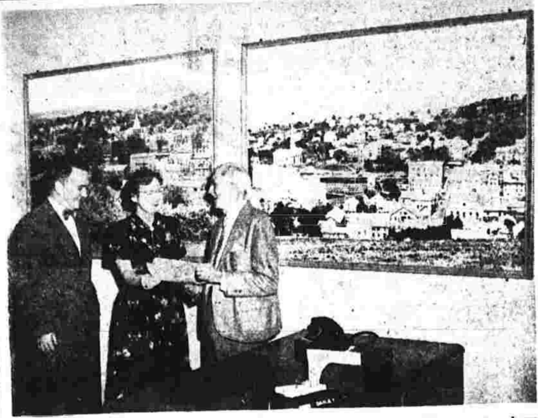
Rockville, May 10.—Two photographs of Rockville—covering a span of eighty years—are shown on the wall of the telephone business office on Park Place.