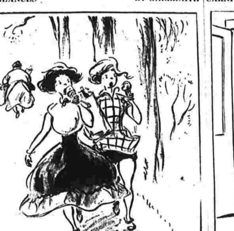
SENSE AND NONSENSE